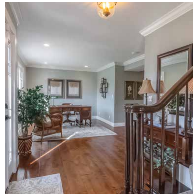
FOYER AND DEN

Relocated the home's kitchen and fireplace in sitting room to create a modern setting.