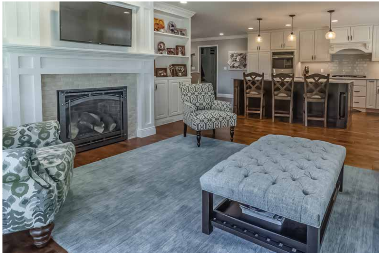
KITCHEN AND SITTING ROOM

Designed a sitting room off of new kitchen with relocated fireplace, french doors, flooring and custom bookcases.