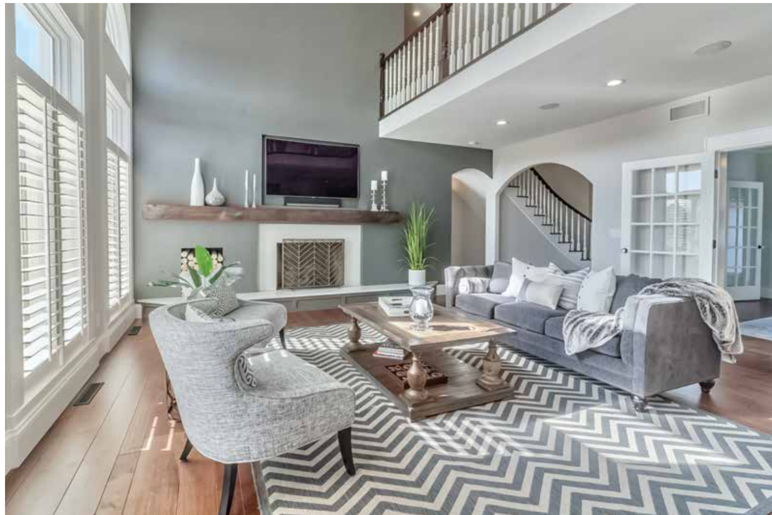
OPEN CONCEPT GREAT ROOM

Gut rehab and redesign of the kitchen including rerouted plumbing, flooring, electrical, lighting and trim.